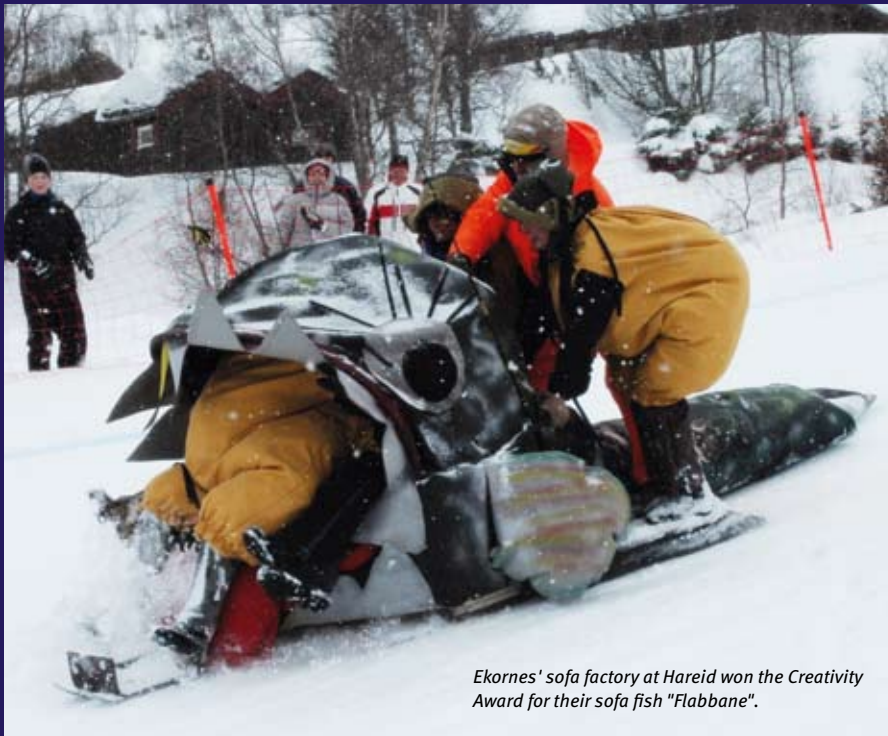
Ekornes' sofa factory at Hareid won the Creativity Award for their sofa fish "Flabbane".

Ekornes won three coveted awards when the company took part in this year's Norway Cup in Furniture Sledding at Strandafjellet in March.