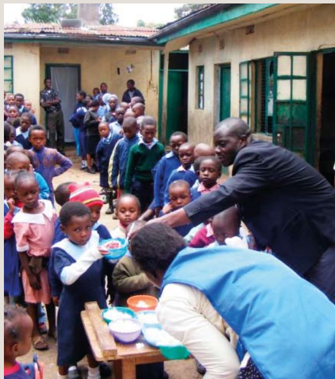
Children queuing orderly for their daily hot meal.