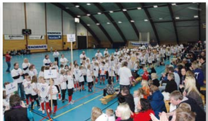
The Ekornes Cup drew in more than 500 children.