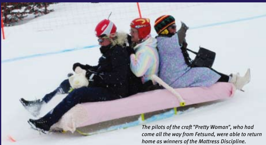
The pilots of the craft "Pretty Woman", who had come all the way from Fetsund, were able to return home as winners of the Mattress Discipline.

– The Furniture Sledding Cup is an event with a great atmosphere where both the participants and the audience take everything with a good sense of humour and have fun together. I would highly encourage even more people to take part next time, says the organiser.