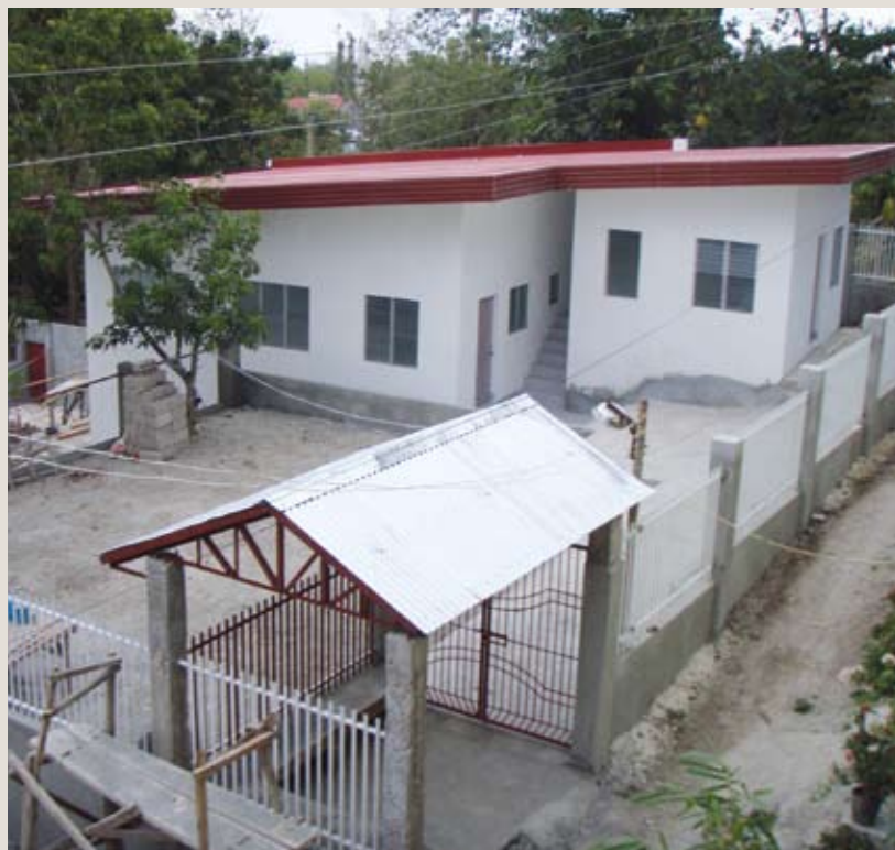
The construction works at Lola Daycare Center are now coming to an end.

A lot has happened in the four months that have passed since Ekornes decided to give its Christmas present to three charity projects in Brazil, Kenya and the Philippines. Here is an update.