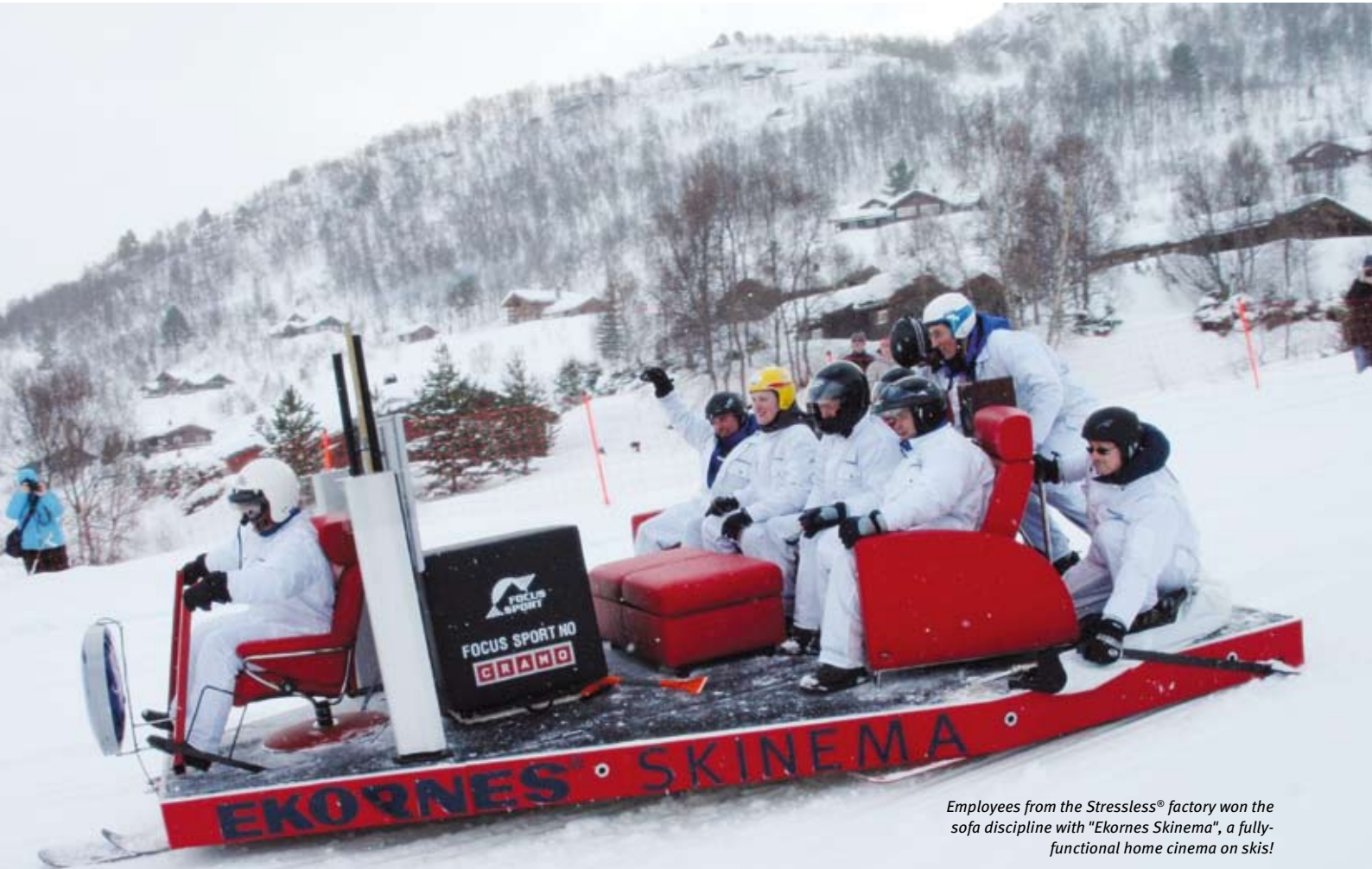
Employees from the Stressless® factory won the sofa discipline with "Ekornes Skinema", a fully-functional home cinema on skis!

INTERNAL NEWSLETTER OF THE EKORNES GROUP, NO. 2 - MAY 2010