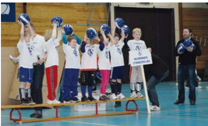
"Ikorndnes Lightning Strike" receive diplomas, t-shirts and footballs as a reward for their efforts.