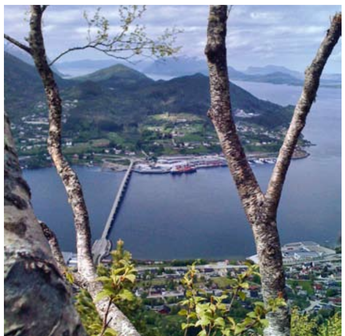
View over the factory and the harbour from Aurenakken.

The picture shows MS North Express leaving the harbour loaded with 21 containers on a Sunday in June. The vessel sails to Bremerhaven/Hamburg, and the furniture is destined for the USA, Australia, China, Singapore and Japan.