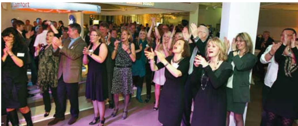
◀ There was a great atmosphere among the 260 guests during the opening party concert. About 50 persons had to make their excuses due to ash clouds from Iceland.

Sortehaug says they couldn't have had a better start. "Almost 100 per cent of all the retailers have already placed orders. A total of 3,000 seating units of Stressless® E200 and Stressless® E300 with the ErgoAdapt™ system have been sold. This is the most successful introduction of a new