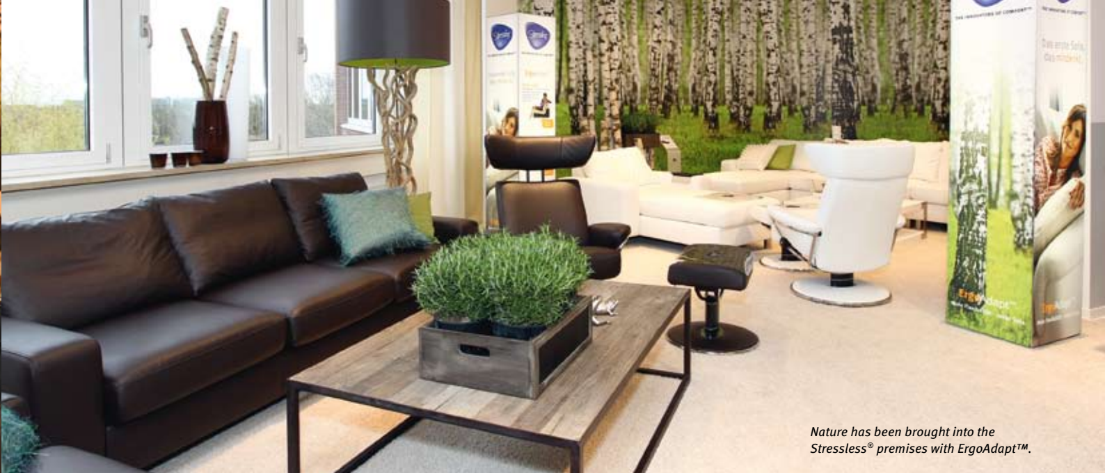
Nature has been brought into the Stressless® premises with ErgoAdapt™.