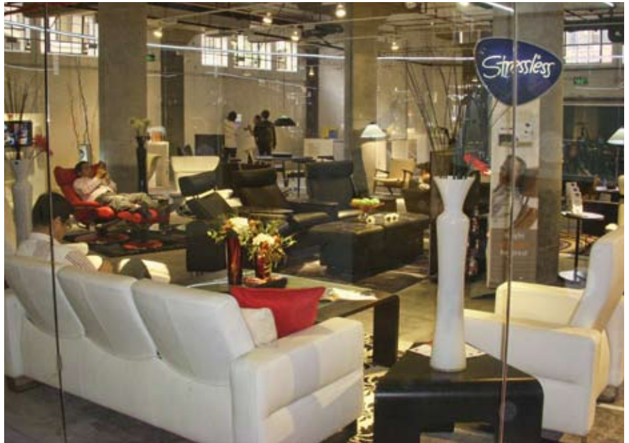
The Stressless® exhibition at Nordic Lighthouse.

In early May, traffic was relatively quiet, but the number of visitors has gradually risen. The average number of visitors to Nordic Lighthouse during the two last weeks of May were approximately 400-500 on weekdays, and 800-900 during weekends.