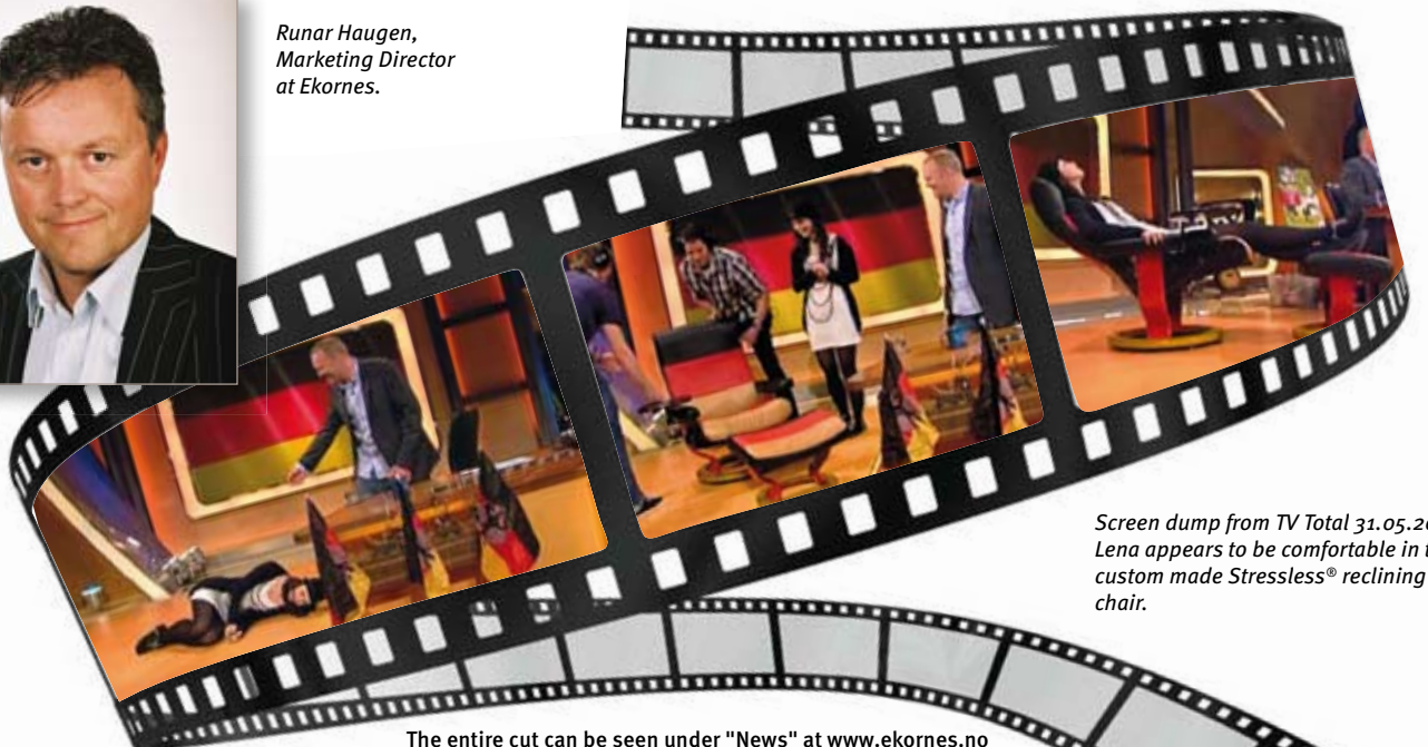
Screen dump from TV Total 31.05.2010. Lena appears to be comfortable in the custom made Stressless® reclining chair.

The entire cut can be seen under "News" at www.ekornes.no