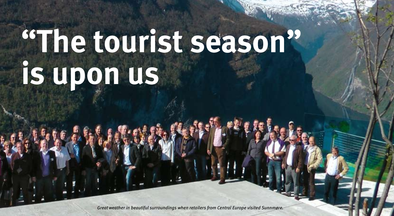
Great weather in beautiful surroundings when retailers from Central Europe visited Sunnmøre.